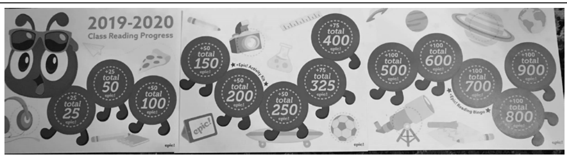
4K Reading Rockstars! Congratulations to the 4K class for reaching a new Epic Reading level!! As a class, they have read a total of 700 digital books!