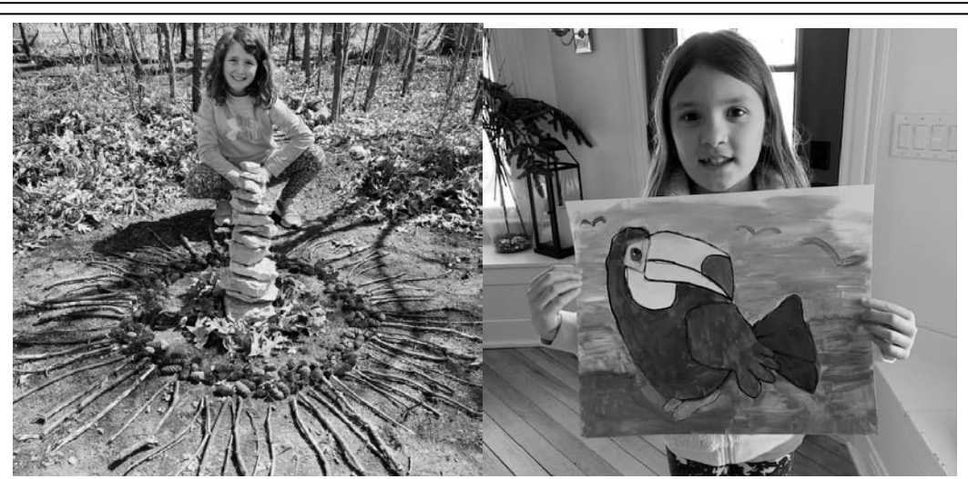
Elementary Artists Hard at Work at Home