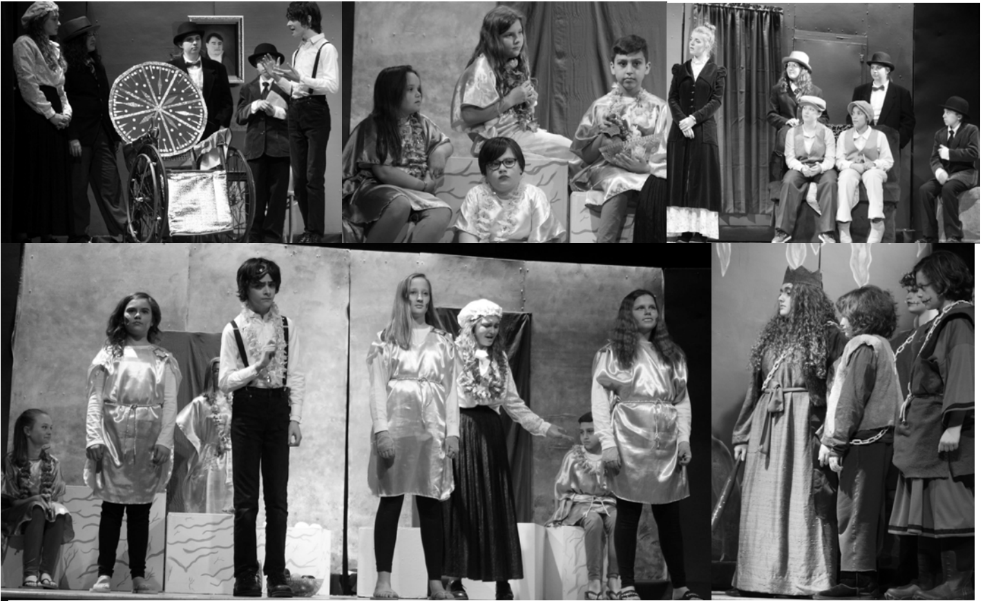
Congratulations to the cast and crew of The Time Machine for putting on amazing performances this spring!