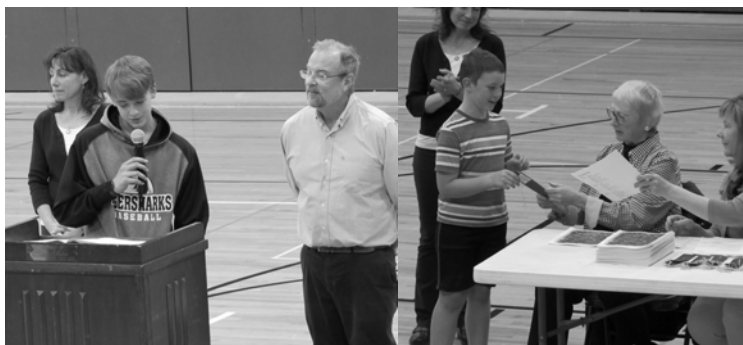
2019 Celest King Poetry Contest