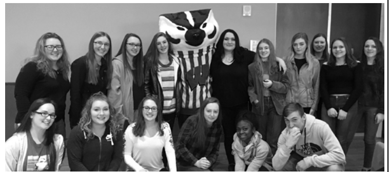
Foreign Language Day