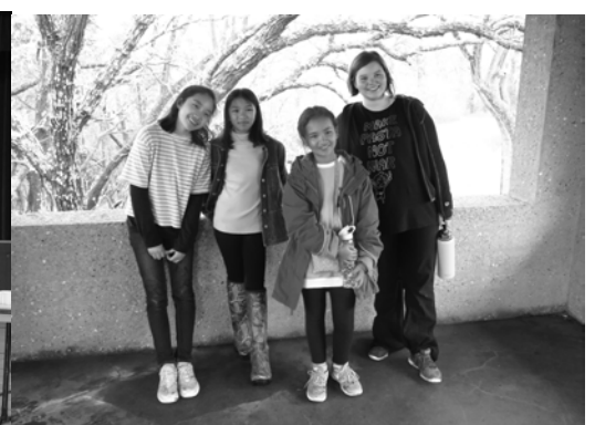
Our friends visiting from Thailand, from the Sunshine Exchange Program, gave a presentation to share about their culture with our 4K through 8th Grade students and experienced camping during their visit.