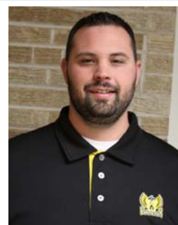
Student Council Members

I am very pleased to be part of this great Green Lake School District, and am very proud to start my teaching career here. The community, staff, and students have been extremely supportive. I teach a variety of technology and engineering courses here at Green Lake. I teach Photoshop, Graphic Design, Engineering, Metals, Woods, and some 7 th and 8 th grade technology and communication courses. I was so proud to see the number of students in each of these classes grow as the year got on its way.