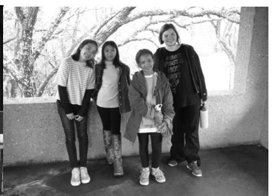
Our friends visiting from Thailand, from the Sunshine Exchange Program, gave a presentation to share about their culture with our 4K through 8th Grade students and experienced camping during their visit.