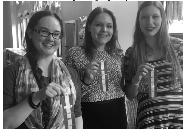
Forensics Regional Concours