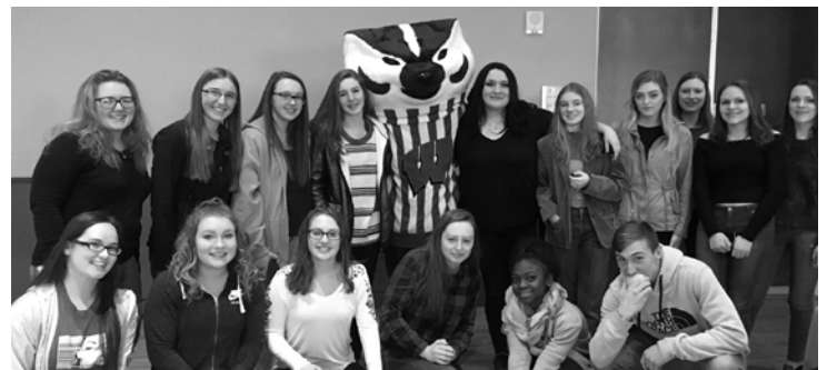
Foreign Language Day