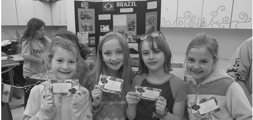
Green Lake students participate in the first annual Cultural Sharing Day