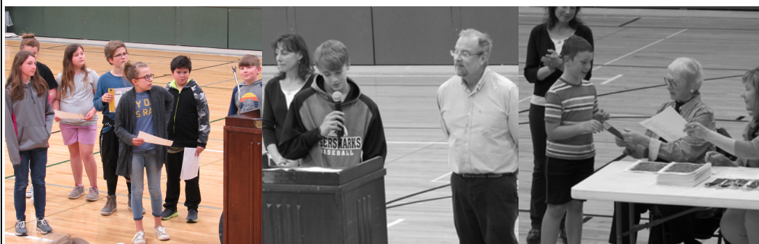
2019 Celest King Poetry Contest