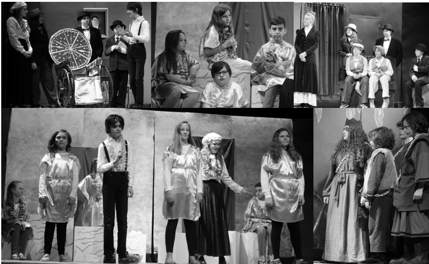
Congratulations to the cast and crew of The Time Machine for putting on amazing performances this spring!