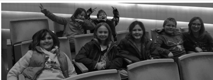
Milwaukee Symphony Orchestra Elementary Field Trip