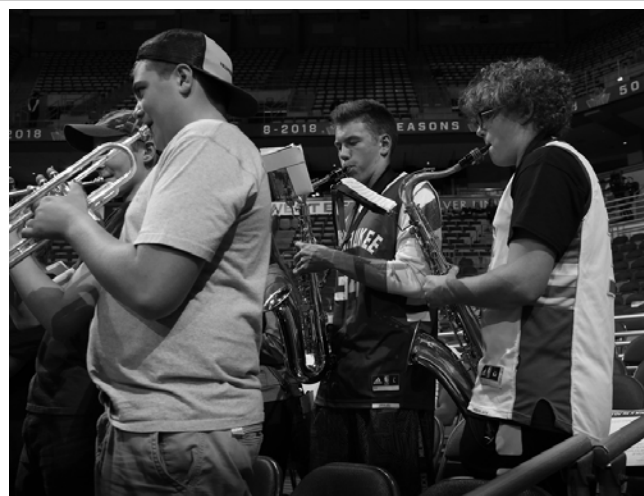
GLHS Band - Bucks Game

Chosen by GLSD teachers, these students exhibit excellence both academically and through community involvement. Each student chosen will attend meetings to learn more about Rotary International.