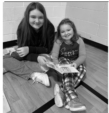
First and sixth grade reading partners

Ask the sophomores you know about the work they are doing and the problems they are addressing. In May, (time and day to be determined) our 10th grade students will showcase their Personal Projects at Green Lake's IB Gala. Also included in the IB Gala: The 8th grade class displaying their Community Project, the 6th grade students sharing their Exhibition work, and Diploma Programme (DP) students featuring their culminating DP work. Everyone is welcome to stop by the big gym to enjoy learning and support our students.